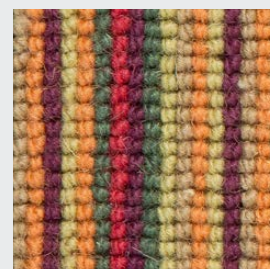
Stripes: Notting Hill